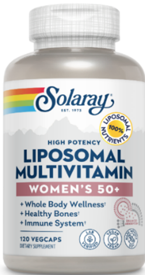
Recalled Solaray Liposomal Women's 50+ (120 ct.)

Individual Commissioners may have statements related to this topic. Please visit http://www.cpsc.gov/commissioners to search for statements related to this or other topics.