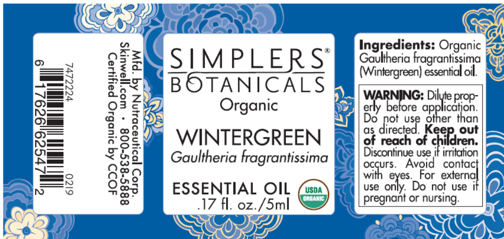
The label of the recalled Wintergreen Essential Oil.